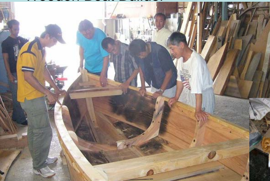
Wooden Boat Builder