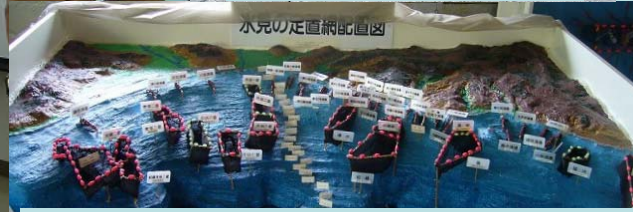
Set-net locations in Himi