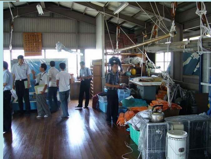
Fishing Technology workshop