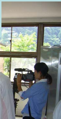
Student Practicing on Food Processing