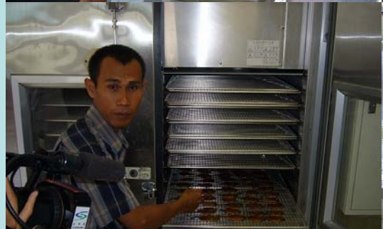
Cooling Drier for fish fillet