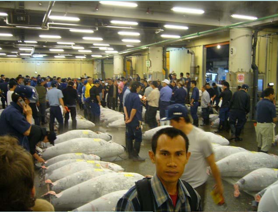
Tsukiji Fish Market